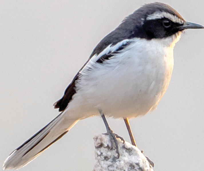
Angola Cave-Chat Xenocopsychus ansorgei