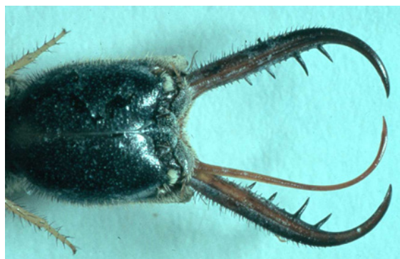
Figure 1: Lacewing larvae are all obligate predators with piercing and sucking mouthparts, comprising a complementary combination between the mandibles and the lacinia of the maxillae, the latter slotting into a groove on the ventral surface of the mandibles to form a tubular canal. Ventral view of head of Palpares inclemens .

can pass. The resulting liquid food can then be drawn into the alimentary canal. This feature is a highly evolved, albeit ancient, evolutionary advance which is unique to the Neuroptera, and provides the autapomorphy (i.e., specialised character or trait that is unique to a monophyletic taxonomic group) that defines the lacewings as a monophyletic evolutionary lineage. When a lacewing larva detects prey, it uses its mandibles to seize the prey, and then injects proteolytic enzymes into the prey’s body. Once the internal organs are liquified, the resultant fluid is sucked into the alimentary canal of the larva, where further digestion takes place. This digestive process is highly efficient and the larvae do not excrete solid matter during the entire larval life, which can last from a few weeks to several years, depending on the species. Accumulated solid matter is voided as a single meconial pellet when the larva metamorphoses into an adult and emerges from the cocoon. This digestive system has also enabled the Malpighian tubules to depart from their normal excretory