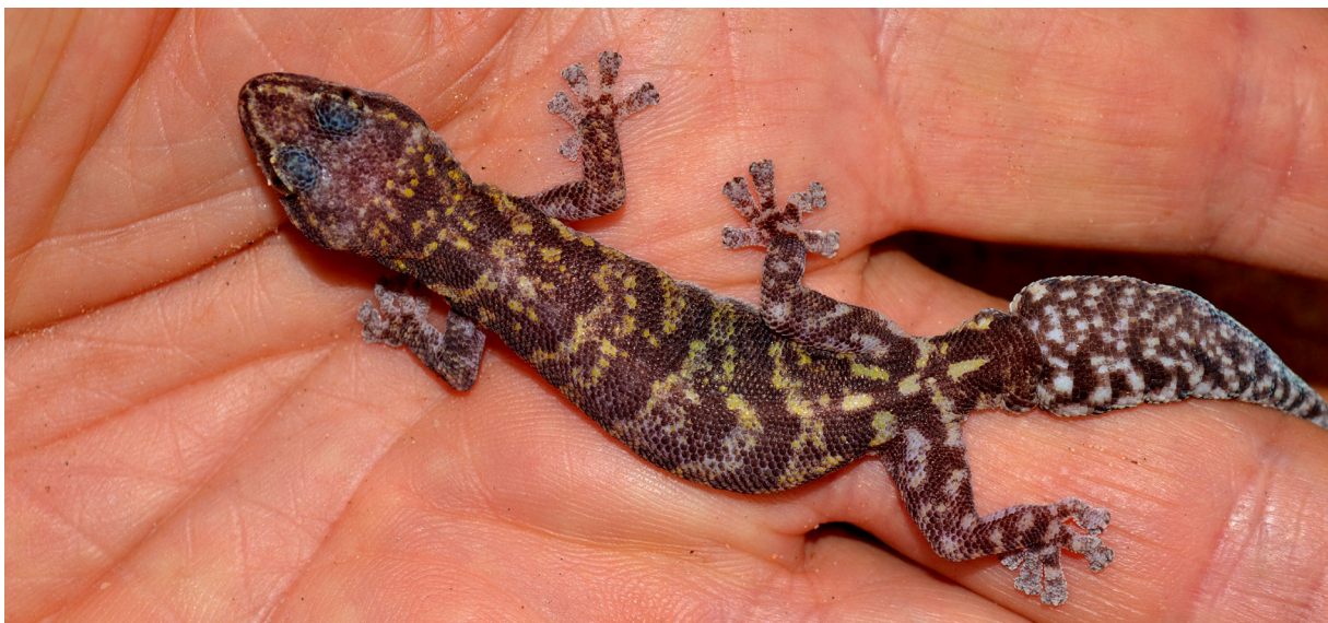
Figure 2: Otjihipa flat gecko ( Afroedura otjihipa ) from the Otjihipa Mountains in northern Namibia.

This species is restricted to areas of higher elevation (1,900–2,000 masl) of the isolated Serra da Neve inselberg in northern Namibe Province. It is sympatric with another highland endemic, Cordylus