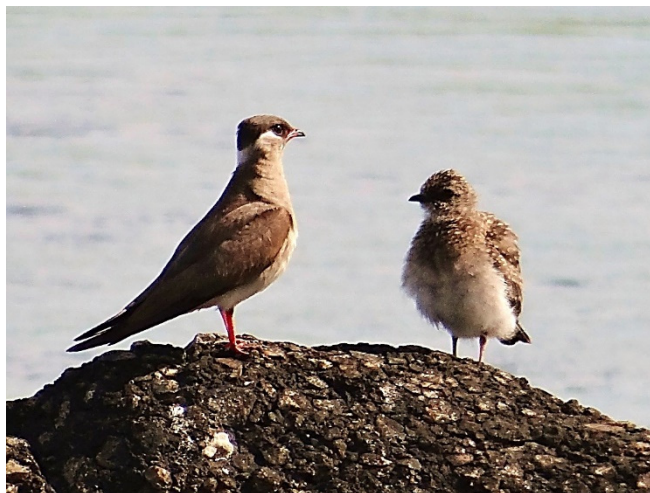
Figure 1: Adult Rock Pratincole (left) with chick about 12 days old, perched on an exposed rock in the Okavango River. Photographed 30 December 2017.

Namibia's Rock Pratincole population is estimated to be fewer than 950 birds (Simmons et al. 2015). However, they have never been systematically surveyed across their range in Namibia, and the numbers actually recorded from isolated counts are much smaller – about 365 birds. I report here on a Rock Pratincole survey in the Kapako area of the Okavango River in December 2017.